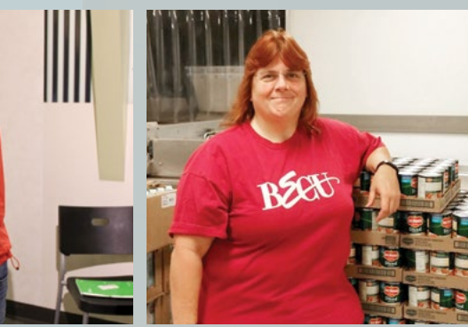
In 2015, BECU employees volunteered more than 12,576 hours at local non-profit organizations. Employee contributions totaled $257,018, and BECU matched those generous gifts for a grand total of more than $514,000 donated to amazing organizations our employees care about most.